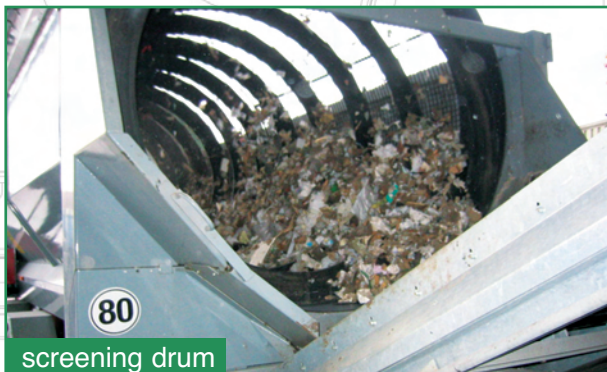
80 screening drum